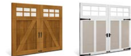
CANYON RIDGE® collection LIMITED EDITION SERIES ULTRA-GRAIN® SERIES

Doors with Clopay's Gold Bar Warranty are standard with heavy-duty, 14 gauge steel hinges and brackets for smooth and long-lasting operation.