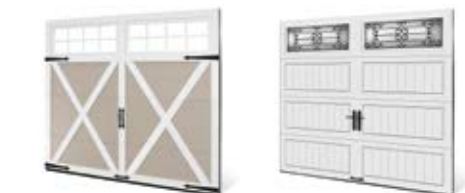
GRAND HARBOR® collection